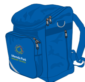
8302200 - Explorer Bag With Laptop Insert