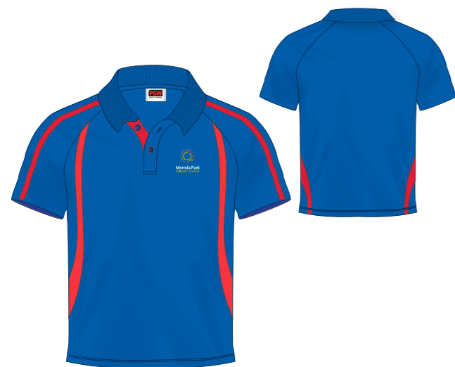
1111825 - Raglan Flow Panel Polo - S/S