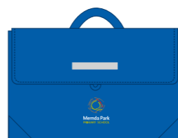
1100525 - Primary Pete Book Bag