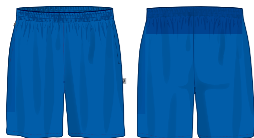
1100330 - Rugby Shorts - Drawstring