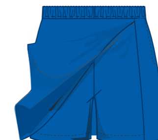
1100375 - Skort