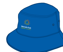
1100525 - Bucket Hat - Poly Cotton