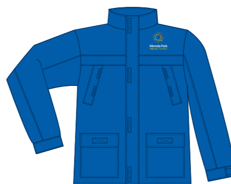
1100200 - Raincoat