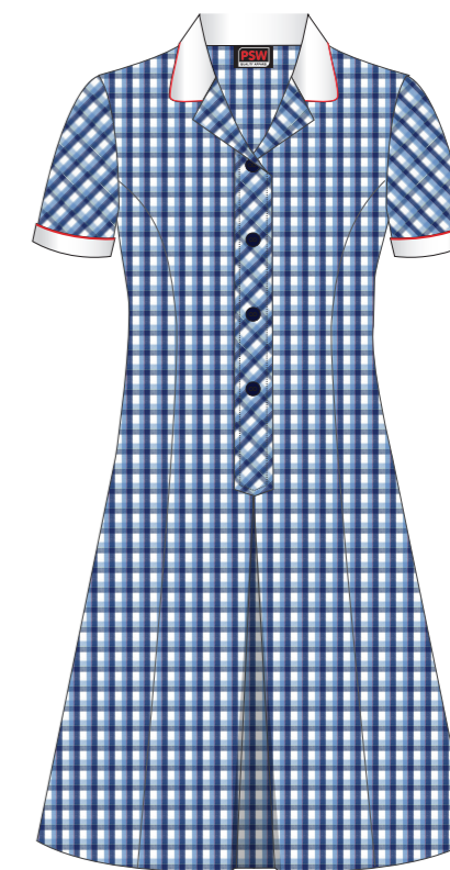
1108015 - Summer Dress