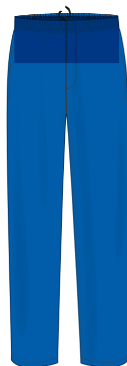
1110400 - Elastic Waist Pants