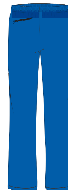
1110465 - Bootleg Pant