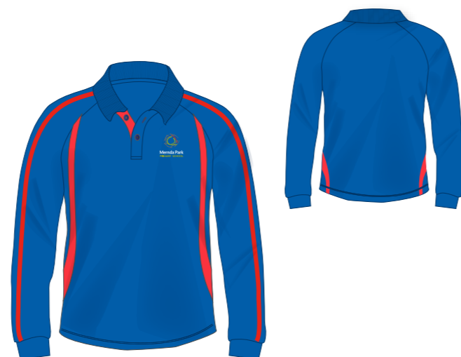
1110300 - Raglan Flow Panel Polo - L/S