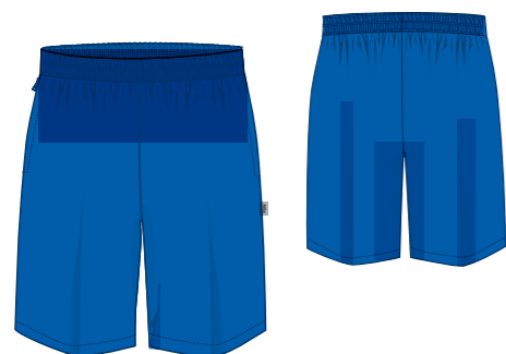
1100355 - Gaberdine Zip Pocket Shorts