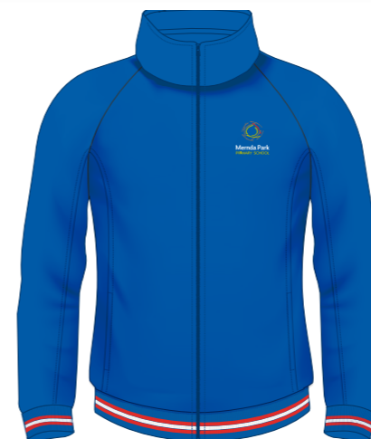
1100736 - Zip Jacket